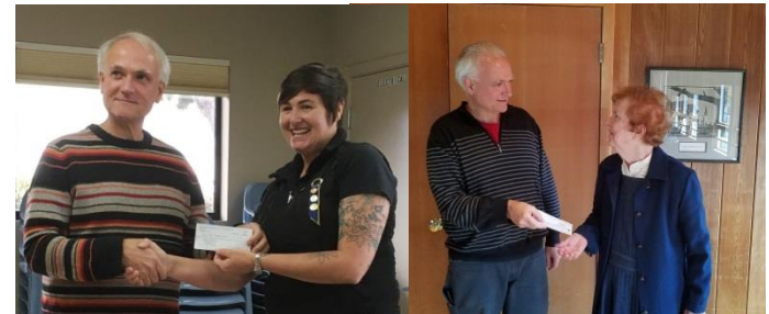
Soroptimists and Mendocino Study Club learn about library services and donate to expansion project.