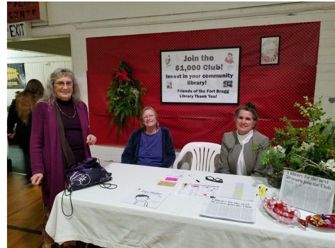
Friends Board members with Founder of $1000 Club, fundraising at craft fair.

"Her imagination lives on in her legacy to Fort Bragg Library."