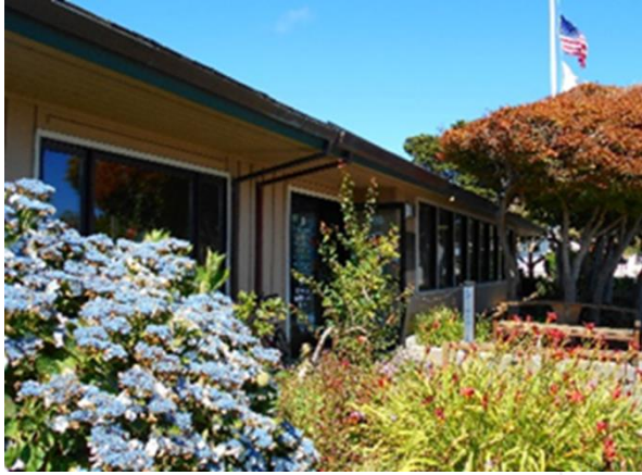
Fort Bragg Branch Library - Library entrance on 499 E. Laurel St, showing floor plan after 2007 remodel.