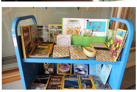
SUMMER READING PROGRAM AT COAST BRANCH

MENDOCINO COUNTY CULTURAL SERVICES AGENCY - LIBRARY