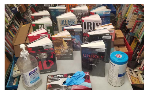
BOOKMOBILE COVID PRECAUTIONS